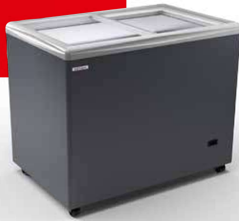
SAO PAULO H100