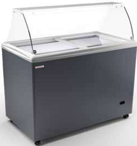
SAO PAULO H125 SCOOP