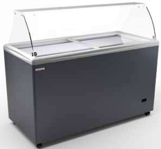
SAO PAULO H150 SCOOP