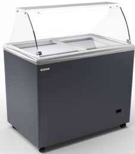
SAO PAULO H100 SCOOP