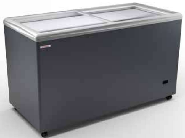
SAO PAULO H150