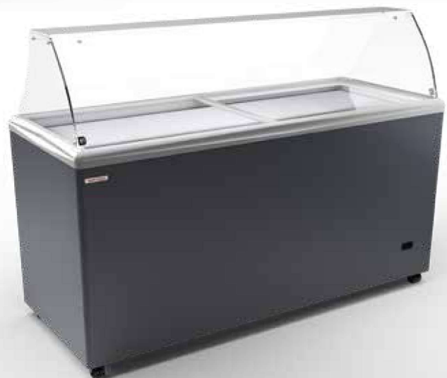
SAO PAULO H175 SCOOP