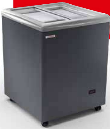
SAO PAULO H68

SAO PAULO can be accessed from all sides and provides the ideal solution due to its different variants.