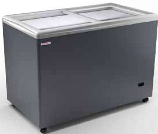
SAO PAULO H125