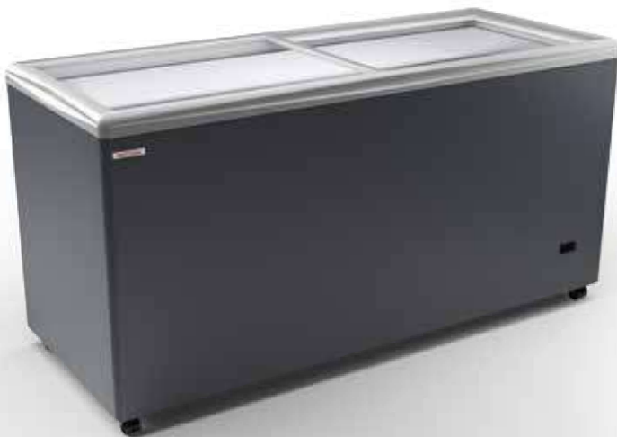
SAO PAULO H175