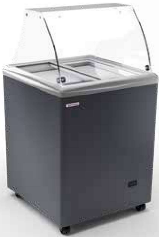
SAO PAULO H68 SCOOP